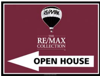
Open House Signs