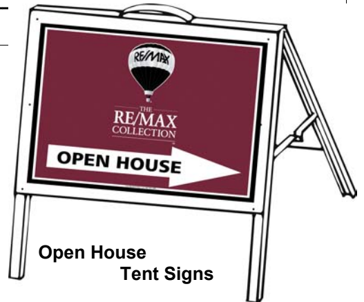
Open House Tent Signs

All Signs 2 holes 16" center T.B., pms 209 Red & Black