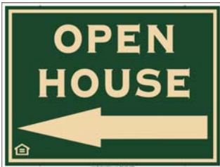
Anthem or Corte Bella Country Club Green & Cream