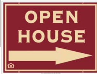
Sun City Festival Country Club Maroon & Cream